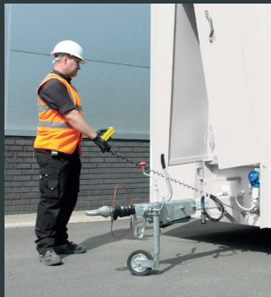
Unhitch from towing vehicle and operate hydraulics using the push button controls

Fast deployment time means more time on the job, making it the money saving choice of welfare unit for rental companies and contractors.