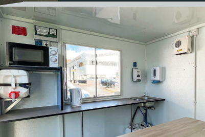
Well equipped canteen