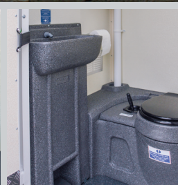
Toilet wash area